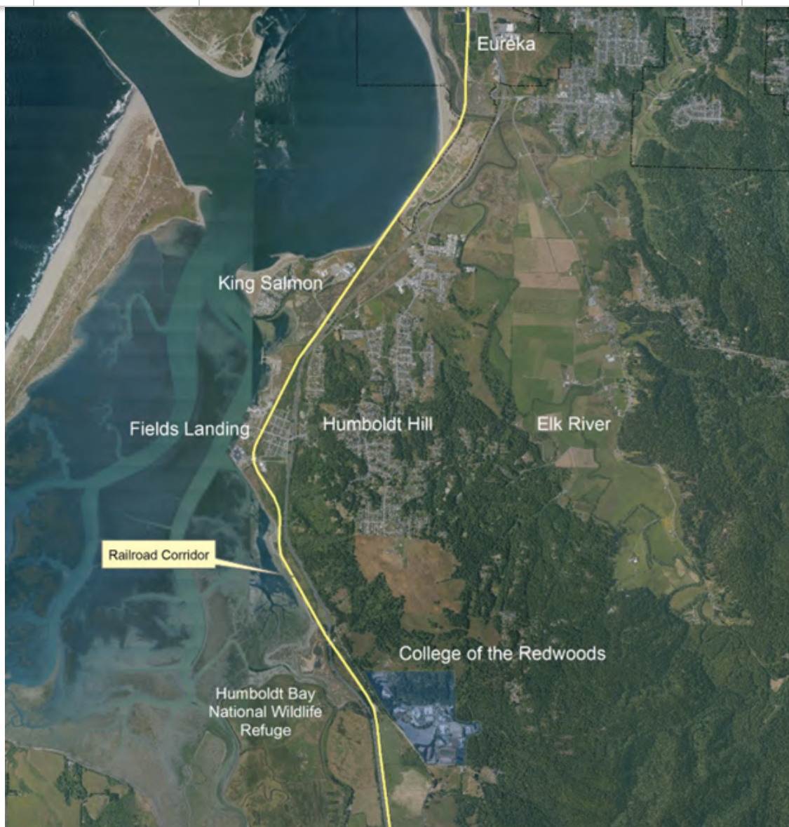
Conceptual extension of the Humboldt Bay Trail along the GRT corridor to connect with College of the Redwoods.