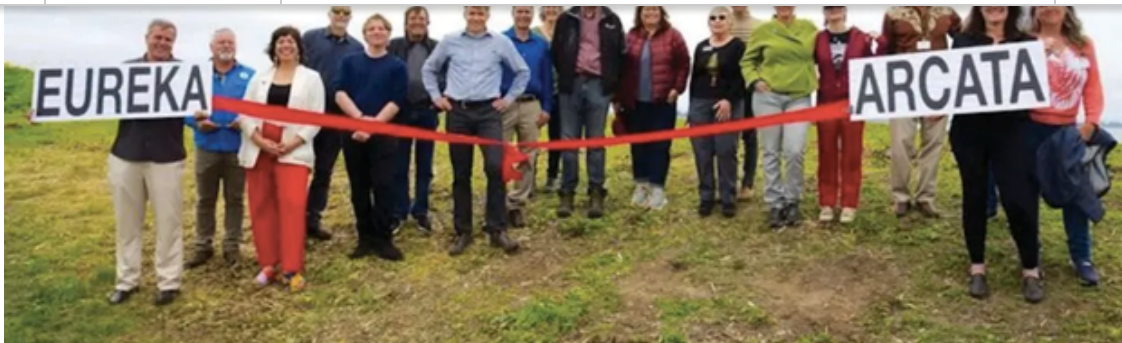
Ribbon Tying Ceremony emphasizing the completion of the trail connecting Arcata and Eureka