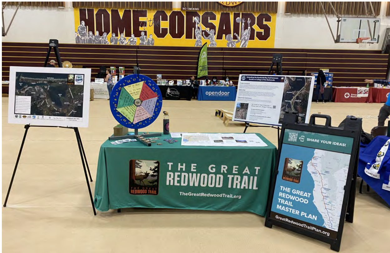
Tabling at community events, such as Festejando Nuestra Comunidad in College of the Redwoods, allowed the project team to share information and collect ideas.