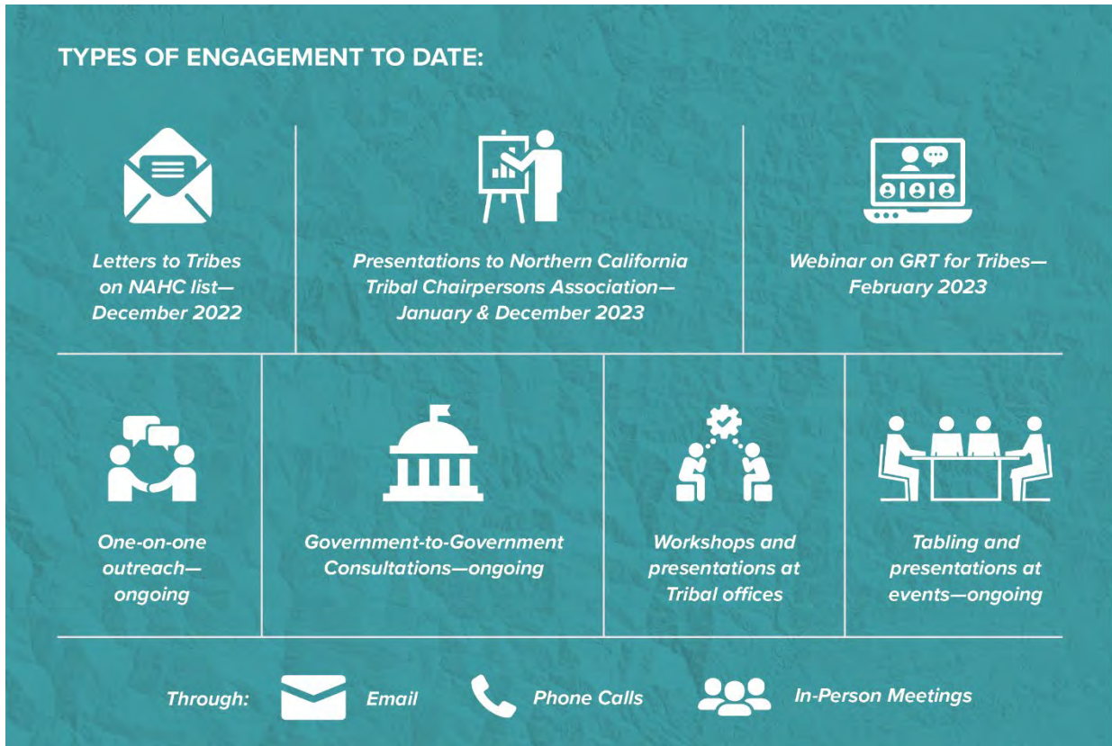
Tribal engagement to date.