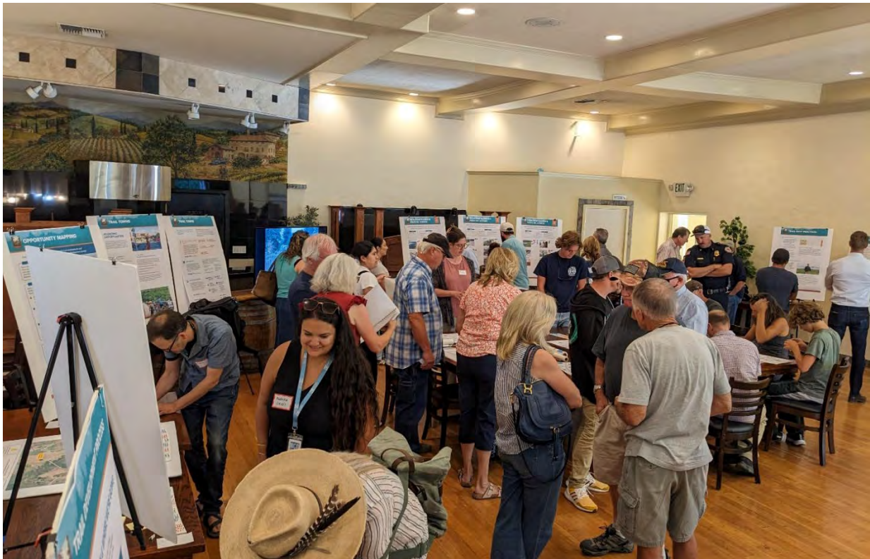
Community members joined the project team for a workshop at Brutocao Cellars in Hopland last July.